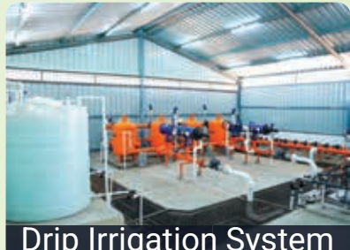
Drip Irrigation System